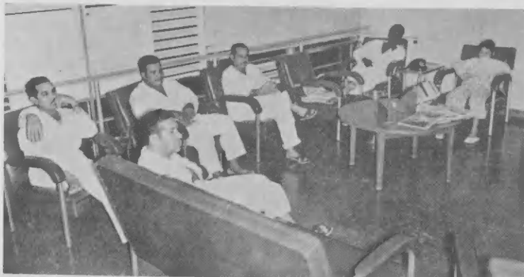
Continuing a tradition for several years, the Seroe Colorado girl scouts with their carols again brought Christmas spirit to the patients of Lago Hospital.